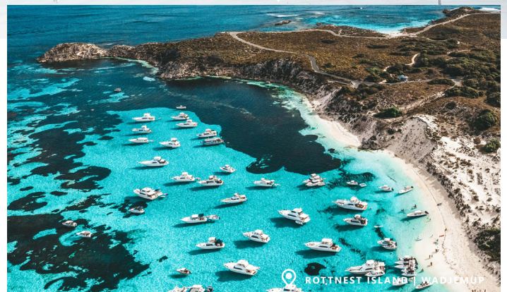
ROTTNEST ISLAND | WADJEMUP