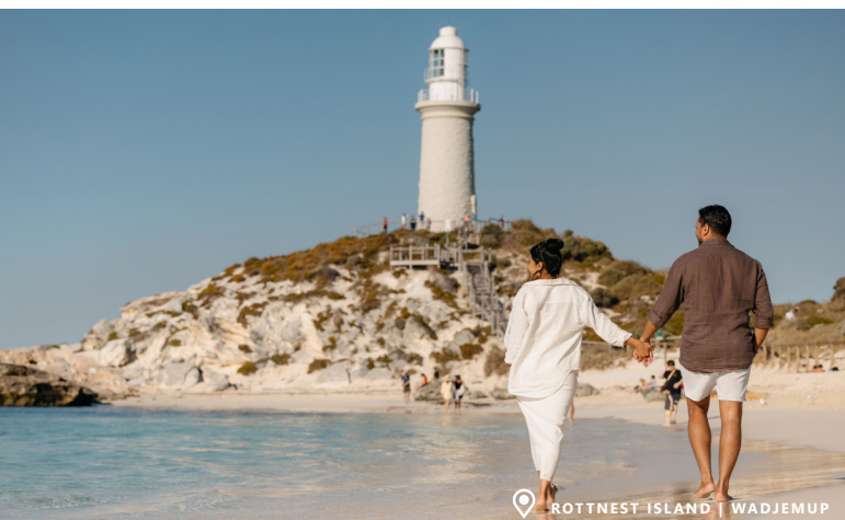
ROTTNEST ISLAND | WADJEMUP