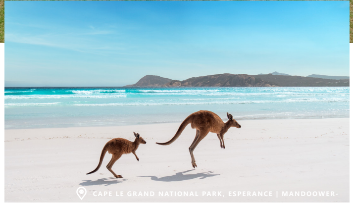
CAPE LE GRAND NATIONAL PARK, ESPERANCE | MANDOWER