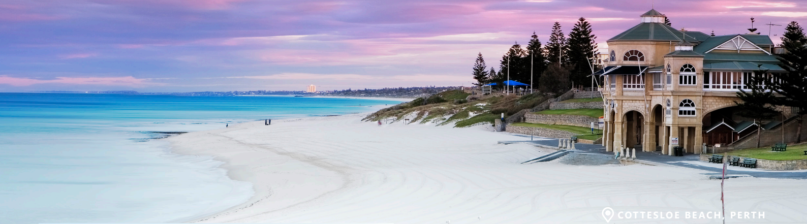
COTTESLOE BEACH, PERTH