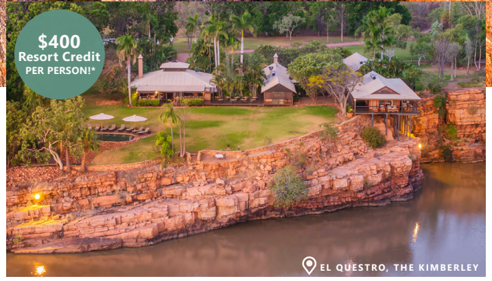
📍 EL QUESTRO, THE KIMBERLEY