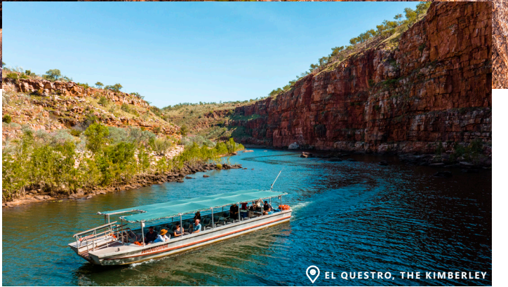
📍 EL QUESTRO, THE KIMBERLEY