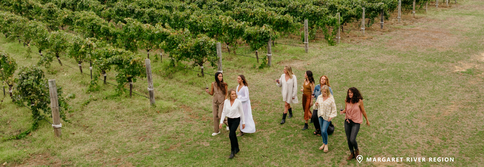
MARGARET RIVER REGION