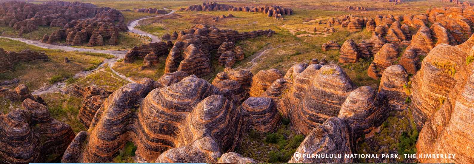
📍 PURNULULU NATIONAL PARK, THE KIMBERLEY